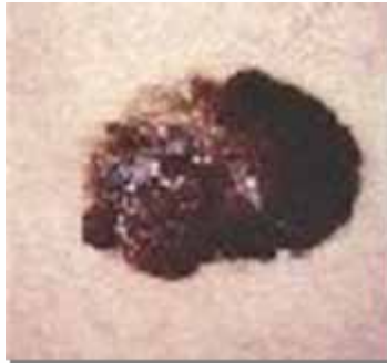
Skin cancer, Melanoma – Raised, Dark Lesion