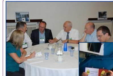
← Syndicate group sharing and learning at a BHSEA workshop