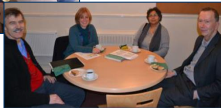
Opportunity for a chat / networking after a monthly meeting →