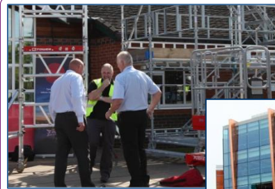
← Practical demonstration at construction WWT/SHAD event