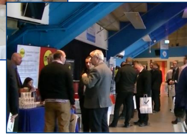
Delegates visiting trade stands at a BHSEA / WWT Conference & Exhibition →