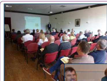
← Monthly meeting presentation with questions and answers