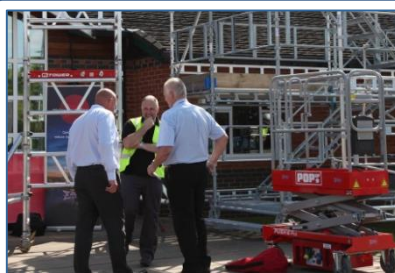
← Practical demonstration at construction WWT/SHAD event