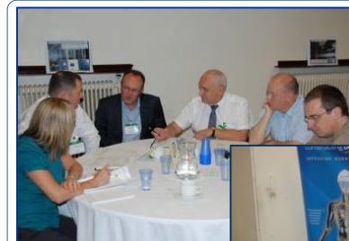
← Members networking, sharing and learning