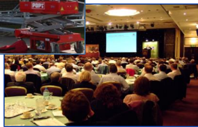
Delegates at a BHSEA seminar →