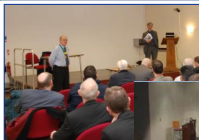
← Speaker answering questions at a monthly meeting