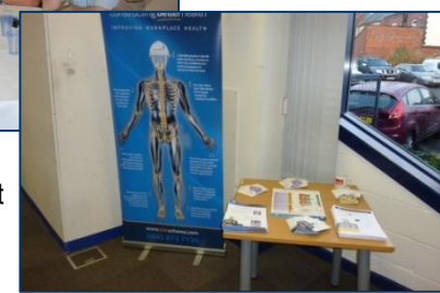
Trade stand / display at a BHSEA occupational health seminar →