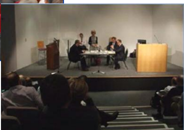
Mock trial with over 100 delegates →