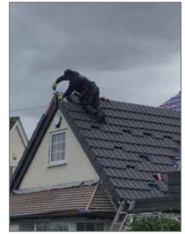
Reported by a member of the public