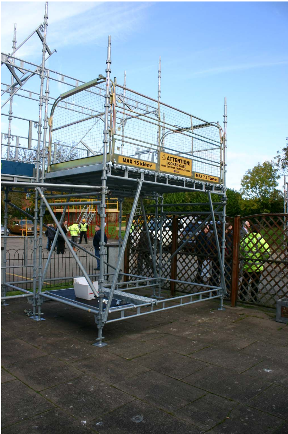
The HAKI Loading Deck security gate

Another novel piece of equipment on show at Coventry, was the HAKI system scaffold with the new lockable loading gate – yet another security device!