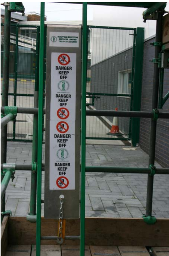
The SES Ladder Security Device

These two security devices from BHSEA Member, Scaffold Erection Services, go a long way to improving access security on scaffolds. The ladder device is lockable with suited locks to facilitate independent access by tradesmen and scaffolders at different working times. The board access trap is also lockable by the same system and SES have taken the opportunity to widen the access through the boards from the traditional two-board width to a much more comfortable three-board size!