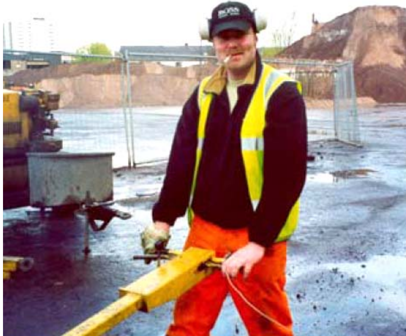
16m/s 2 : 12 minutes re 2.5m/s 2 ; 48 minutes re 5m/s 2 .

Personal behaviour, Peter added, has a very large impact on the health risk posed by any given vibration exposure, as he displayed this ‘action photo’!