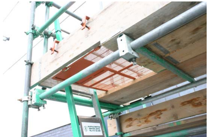
The SES Scaffold Access trap.

The photograph on the bottom right shows SESs novel approach to accommodate extendable transoms that can be placed up to the building to enable tradesmen to work on safe boards. As work progresses upwards, other extendable transoms on the main lifts can be retracted without the other ends being moved in front of the face of the scaffold into pedestrian walkways.