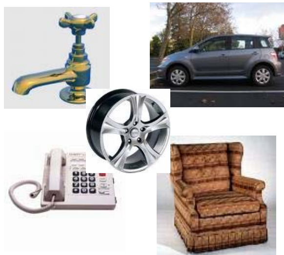
Examples of articles containing chemicals

George Allcock of GKN commented that if you imported grease from outside the EU for use in an article that you manufactured, then you became an “Importer”.